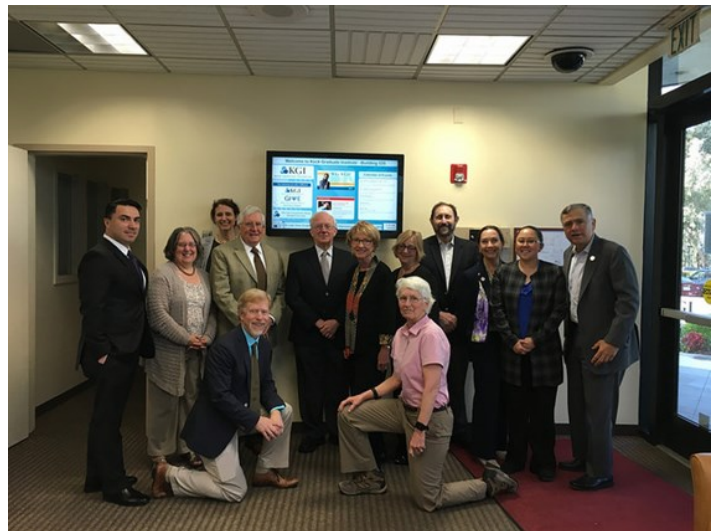
Photo: 2016 Annual PSM National Office Steering Committee Meeting

recognize that we now have an opportunity to help PSM programs select their preferred avenues for our assistance with PSM quality-control. As noted in your responses to our surveys, there are concerns that may be unique to institutions and programs that require thoughtful consideration and we seek your help for additional guidance, advice and feedback. We recognize the time investment that PSM program administrators spend on affiliation/accreditation including application management and review, site visits, program marketing, and other activities. Please be on the lookout as we announce opportunities for an open forum and continued dialogue on this matter. Our goal is to ensure our decision making process on any PSM affiliation and/or accreditation matters will be collaborative with all currently affiliated institutions and programs.